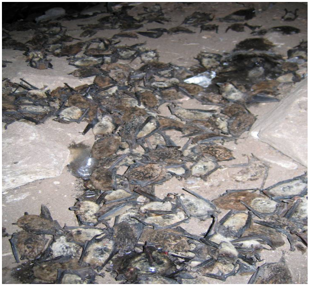
*Little brown myotis carcasses littering floor of Aelous Cave, VT