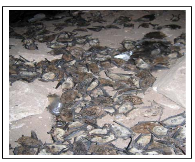
*Little brown myotis carcasses in Aelous Cave, VT in 2009