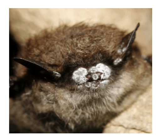
*Little brown myotis with growth of the fungus causing WNS on its rostrum