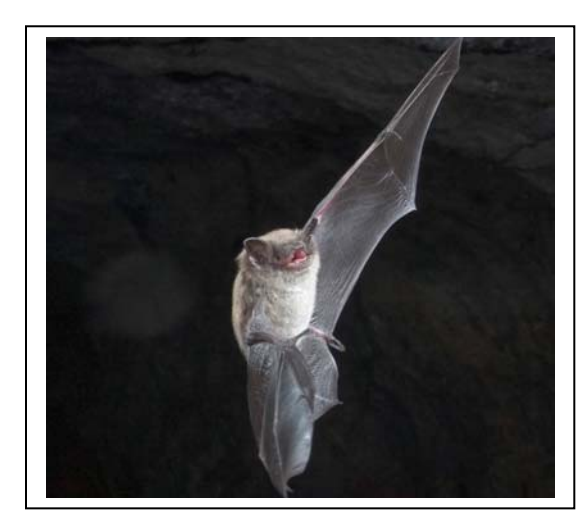
*Healthy Little brown myotis in flight